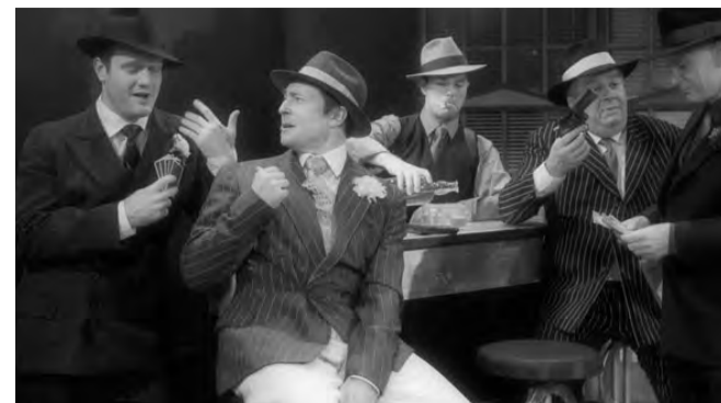
The wise guys check the essentials: card tricks, scotch and their pieces

This year's crazy cabaret is christened Mamma Mafia , and takes place in the sleazy gangland of New York in peak-Prohibition, deep-Depression 1930. Five poverty-stricken Italian families fight for survival and, as we might expect from the title (and, um, the Italian angle, perhaps), most turn to a life