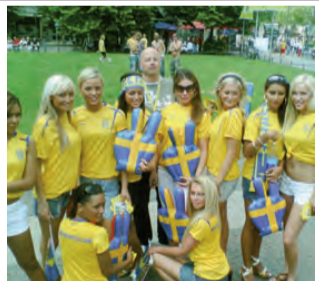
The Swedes always give good TV

My biggest concern is that I'm going to lose my Swedish channels. For decades their state channels have been free-to-air (to most of the country) and consistently supplied better and more current programmes than their Danish counterparts. Without them the future of affordable TV in this country (like in the UK if you want to watch any kind of